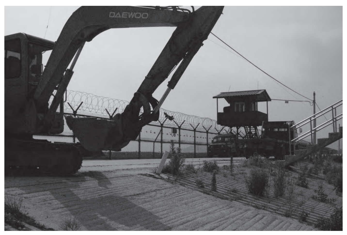
Santiago Sierra, Position exchange for two distinct, 2005, 30-meter volumes of earth, video still.

For further information and press material, please contact: press@terrestrialassemblage.com