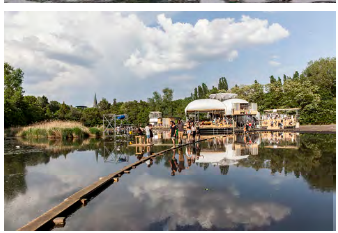
Floating Architecture, impressions from 2018.