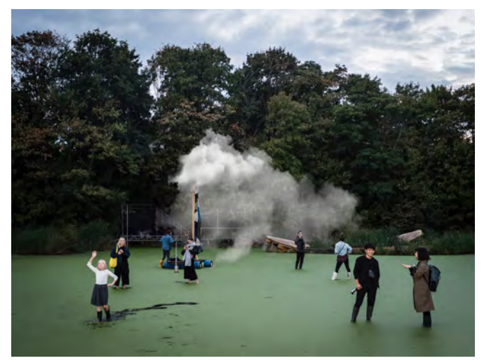
Han Seok Hyun, My Head in the Clouds - Test Run (simulation), 2021, ephemeral cloud sculpture: rainwater, high-pressure pump, electricity, water filter