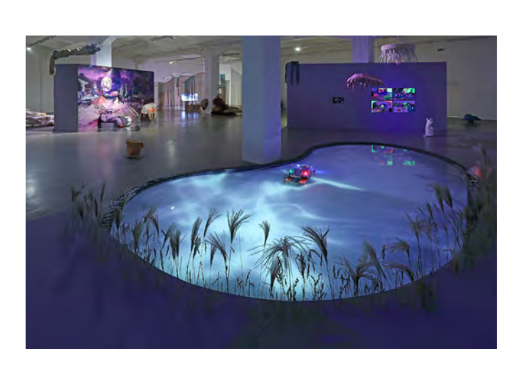
Marco Barotti, The Egg , 2019, kinetic sound sculpture, 75cm x 150 cm. Courtesy of the artist; Shira Wachsmann, A Dream , 2020, video still; Folke Köbberling, Testphase , 2021. Courtesy of the artist; Anne Duk Hee Jordan, Making Kin , 2020, Installation view, Kunsthaus Hamburg, Germany. Photo: Hayo Heye. Courtesy of the artist.